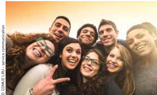
© COMUE LRU - service communication

➔ Student unions and offices: these exist within each university; obtain details about them from the websites of the institutions concerned.