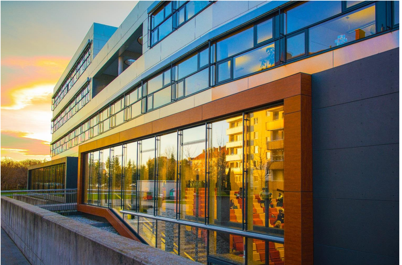
Campus of St. Pölten UAS

Situated 60 km to the west of Vienna in Austria's oldest baroque town, St. Pölten University of Applied Sciences was founded in 1996 and is an expanding institution of higher education with currently about 3,400 enrolled students.