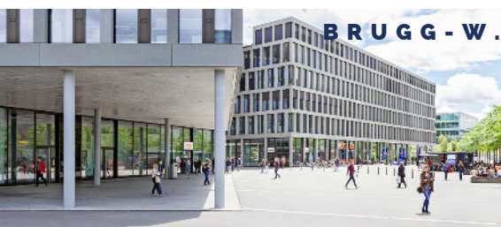
B R U G G - W .