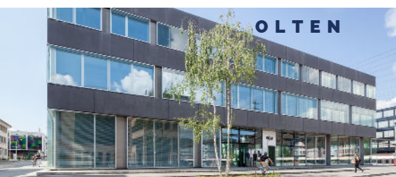
O L T E N